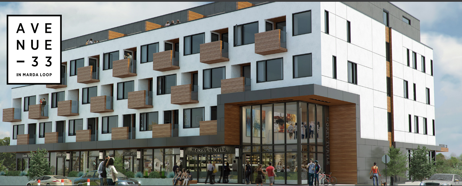
Avenue33: 3450 19 St SW, Marda Loop